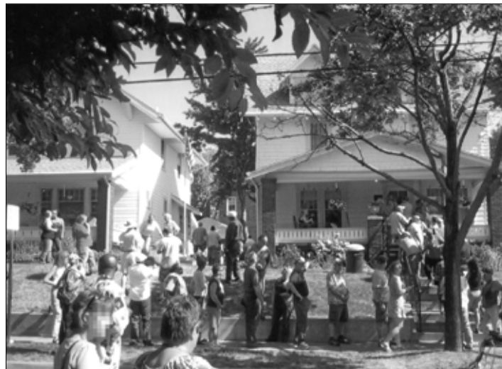
Pictured here is Dr. Bob's home at 855 Ardmore Avenue, Akron on the right. A Dr. Bob museum is in the house to the left.

This is Dr. Bob's recollection of his initial conversation with Bill W: "Now, as he finished his story with these wry attempts at humor, watching to see if Bill 'understood,' something began to dawn on Dr. Bob S. Slowly, at first, then with sudden clarity, he understood. Bill Wilson had been able to control his drinking problem by the very means-- the Oxford Group-- that Bob himself had been trying to use...but there was a difference. 'The spiritual approach was as useless as any other if you soaked it up like a sponge and kept it to yourself.' The purpose of life wasn't to 'get,' it was to 'give': for all his dabbling in religion and philosophy, Dr. Bob had never before realized that simple and now obvious fact." Not God by Ernest Kurtz