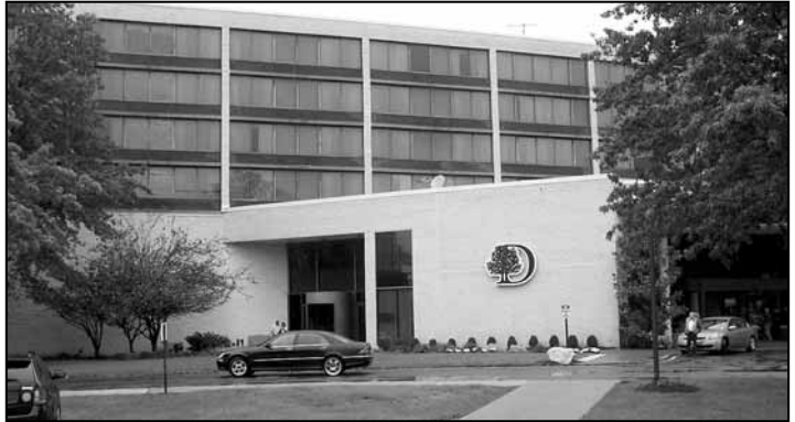
Above: Doubletree Hotel, Somerset Below: Convention coffee station