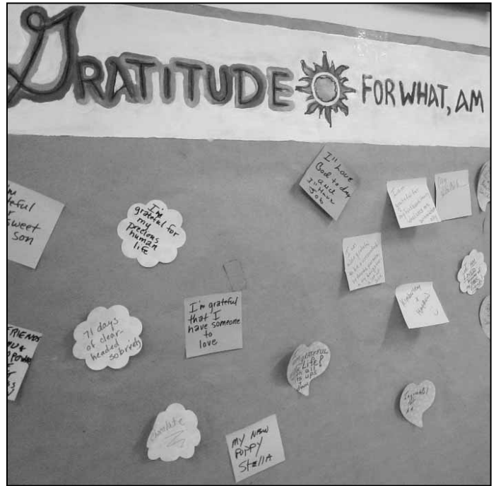
I am grateful to all who participated in NNJGS Area 44, District 34's "Spirituality Breakfast" which was held on Saturday, November 5th at Our Lady of Sorrows in South Orange.

It was a wonderful experience on how AA works, when we work it! The loving presence of sharing, caring and service once again shows me that a Higher Power makes all things possible. For that I am grateful! Next year, we look forward to sharing This Day with all of you.