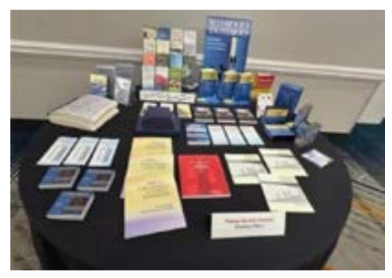
As seen in the photos, at the Conference, the Literature, and Grapevine & La Viña tables were prominently featured.