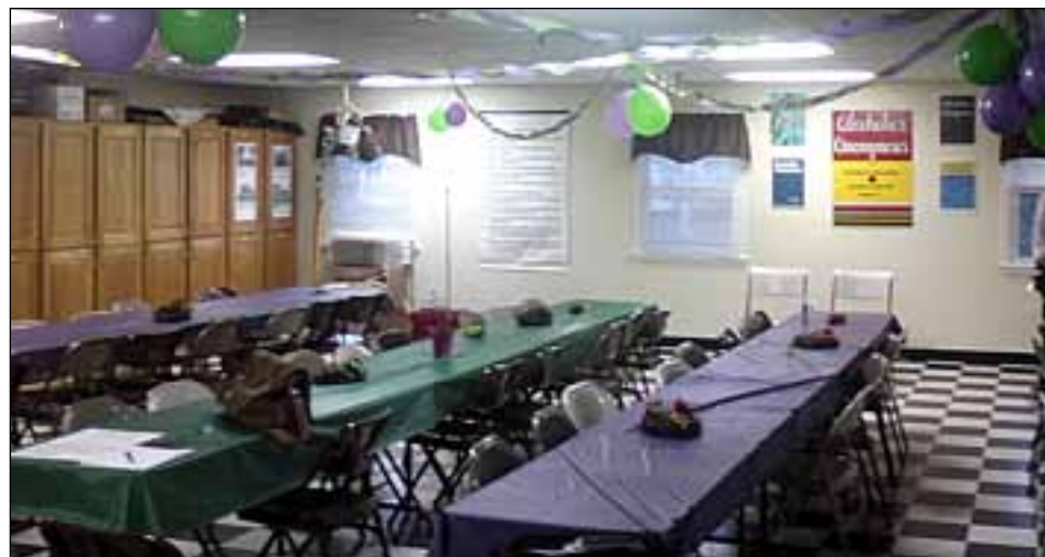
Area Office decorated for the May 4th Annual Grapevine Grapefest.