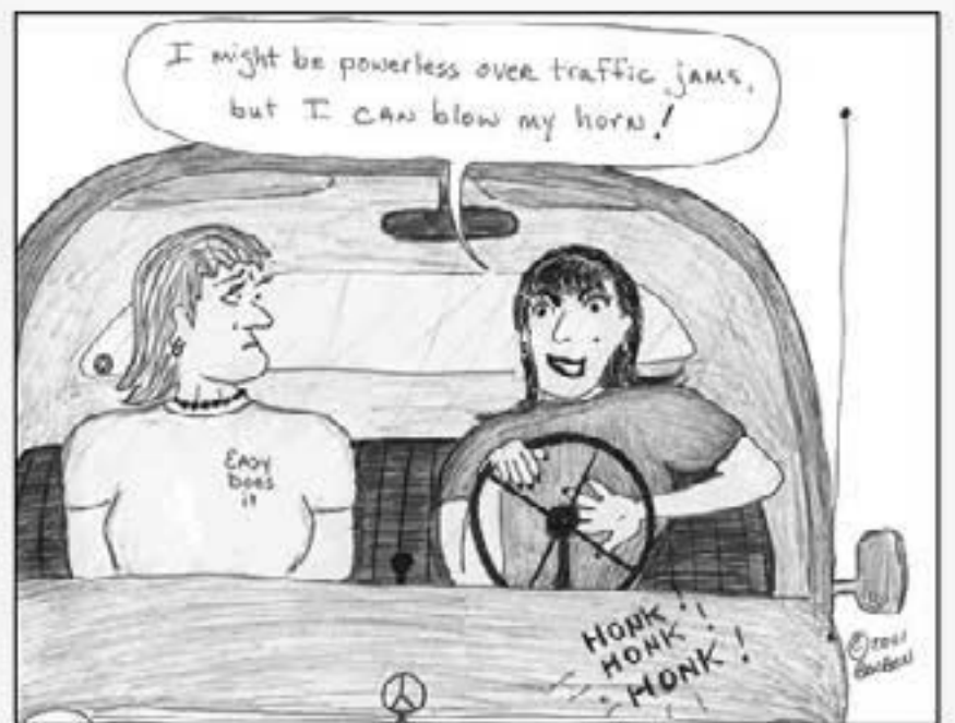
Blow My Horn

GENERAL SERVICE OFFICE PO Box 459 Grand Central Station New York, NY 10163 Payable to "General Service Board"